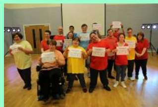
The learners put on an amazing Streetdance show on June 22nd