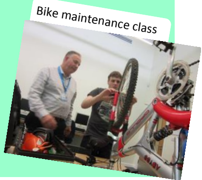
Bike maintenance class